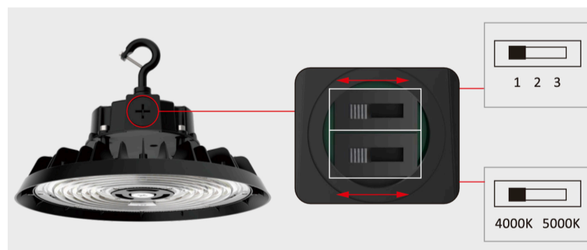
Switchable Wattage - 100 / 150 / 200w